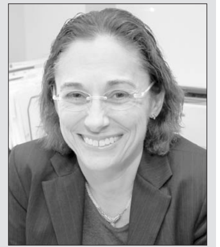
Here are some of the lawyers who have used Klibanow's services:

Areas of specialty: Labor and employment